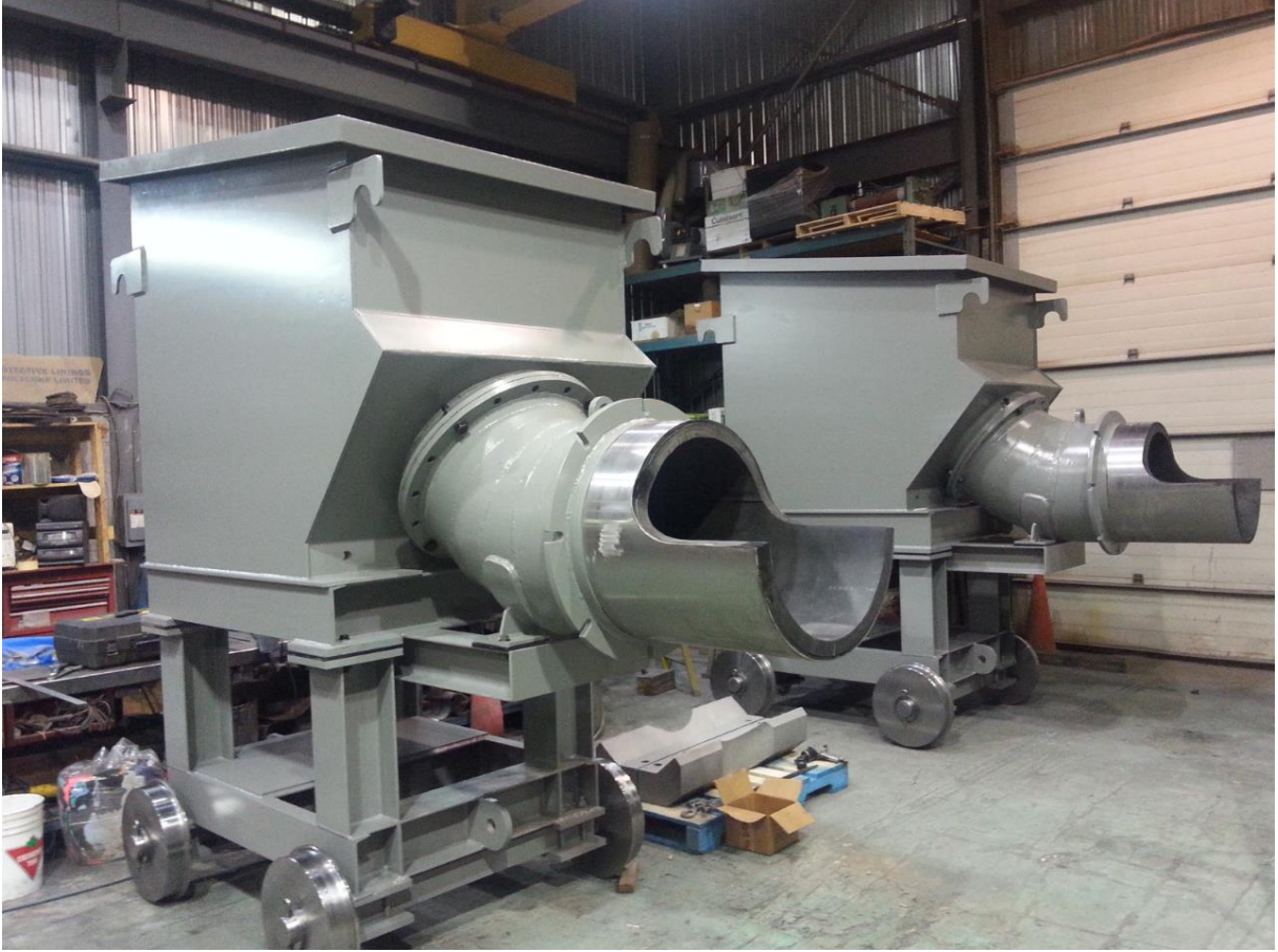
Figure 5 – New feed chutes to be installed