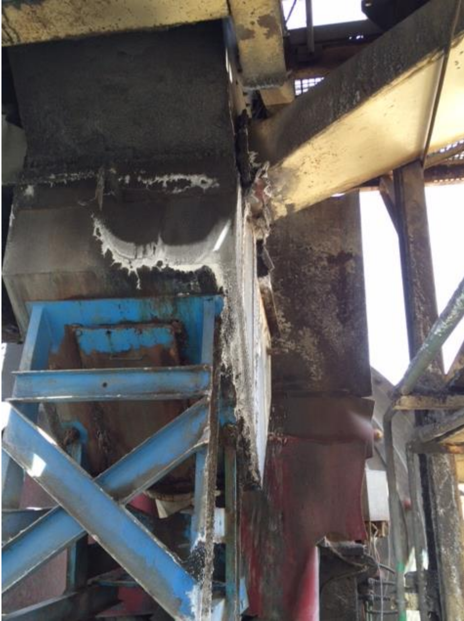
Figure 4 – Mill 2 Head chute to be modified