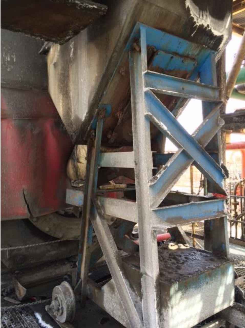
Figure 2 – Mill 2